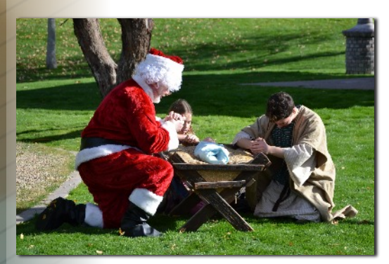
More photos and details at www.GreenwoodMinistry.info