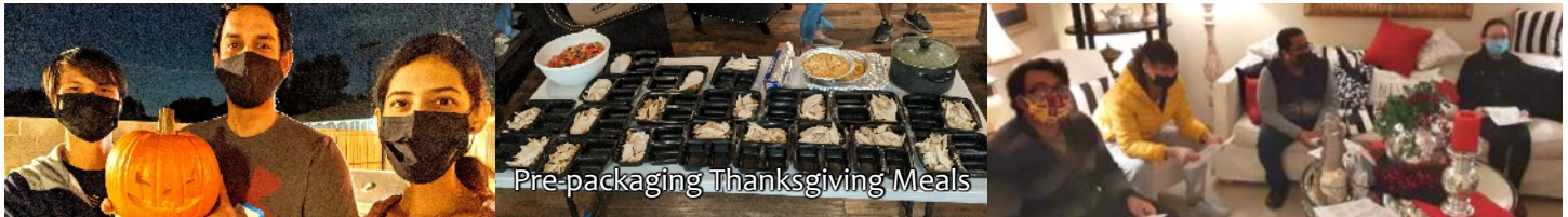
Pre-packaging Thanksgiving Meals

The week before Thanksgiving we offered a home cooked, traditional American Thanksgiving meal - the components of which were generously provided by ministry volunteers and church friends. The meal was followed by an explanation about why the Pilgrims gave thanks, and more importantly to whom they gave thanks.